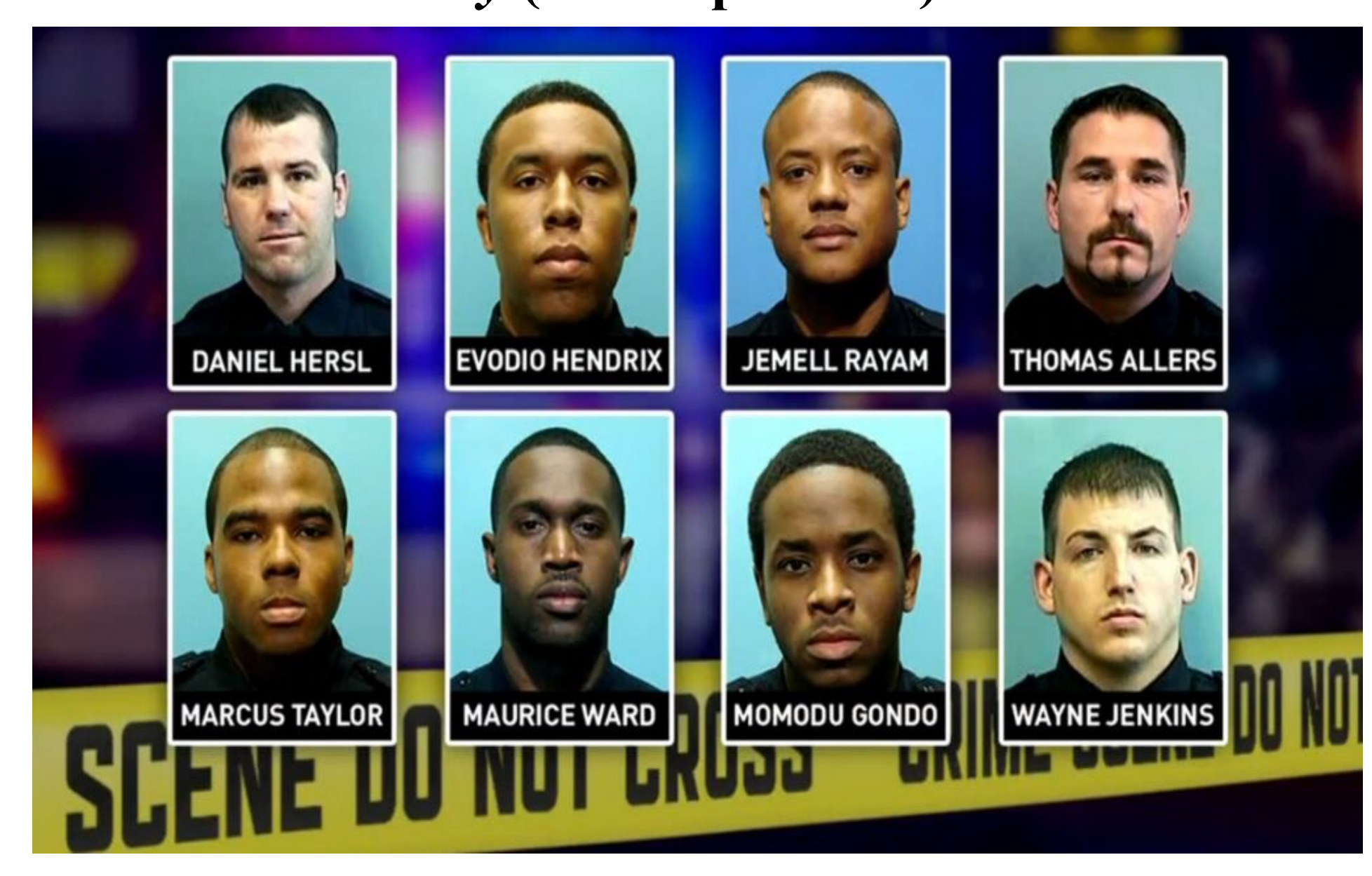
Real Life Gun Trace Task Force from Baltimore, MD