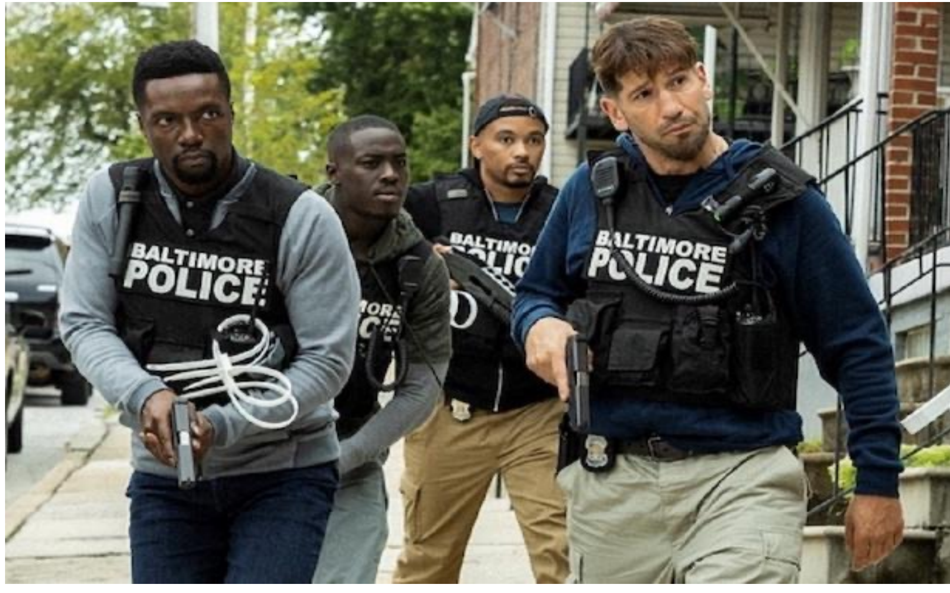
Gun Trace Task Force from We Own This City (not all pictured)

-Bribed Det. Ellis Carver with a sergeant promotion to feed him information on Barksdale detail